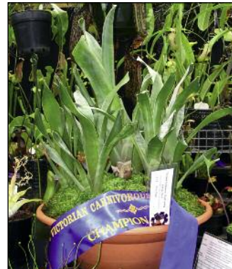
1st place: Brocchinia reducta