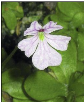
P. immaculata x emarginata