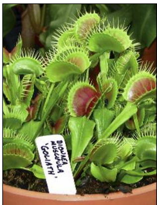
Dionaea muscipula "Goliath"