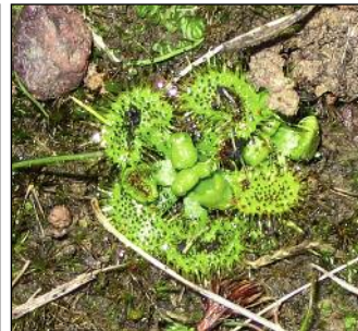
D. peltata var. foliosa from Kuitpo forest.