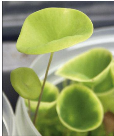
The distinctive leaves of U. nelumbifolia

“At c.1200m altitude, there was a brief transition between the short trees growing in brick-red lateritic soil and the bare rock surface covered with large bromeliads. The