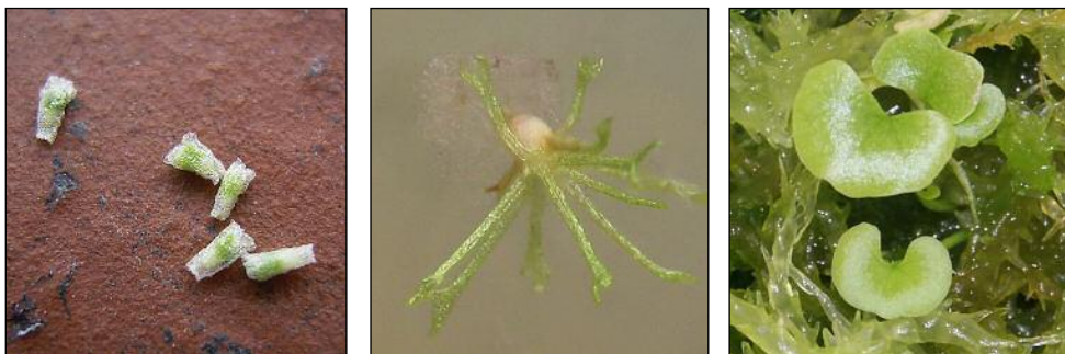
From left: Seed, developing embryo and immature leaves of U. nelumbifolia .