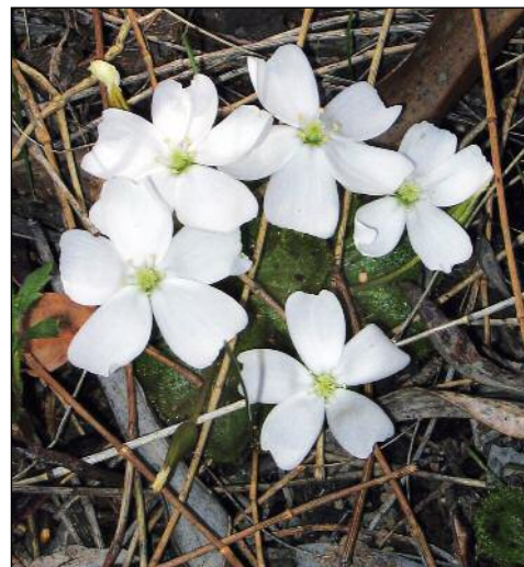
D. whittakerii ssp whittakerii