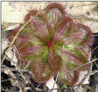
D. whittakerii ssp whittakerii from Onkaparinga N.P.

Carnivorous plants endemic to South Australia.