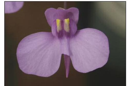
U. nelumbifolia in flower.

terrain had been a bit of a problem too, but I’m sure it would’ve been much worse if it had rained. I sure wouldn’t have liked to find out how slippery that smooth bromeliad-covered rock surface became when wet!”