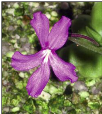
P. moranensis "huahuapan"