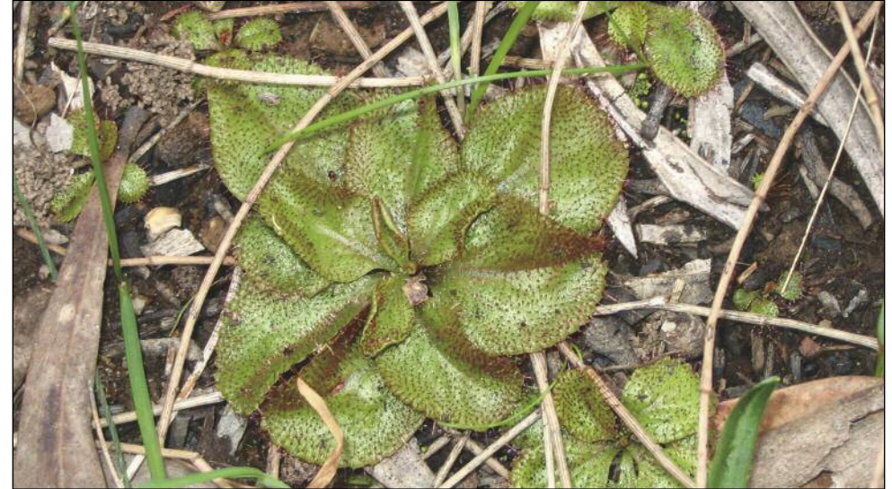
Drosera praefolia from Onkaparinga National Park.