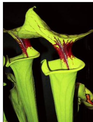
Sarracenia flava var. rugelii