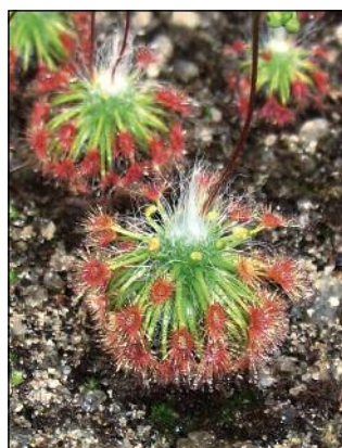
Drosera parvula ssp sargentii