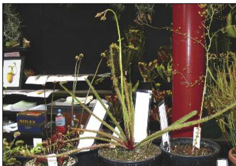
Centre: D. regia , right: D. gigantea ssp gigantea