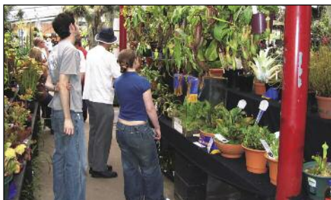
The Nepenthes display.