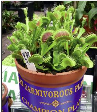
Grand Champion: Dionaea muscipula "Goliath"

The members of the VCPS put on a fantastic display for our 2005 show.