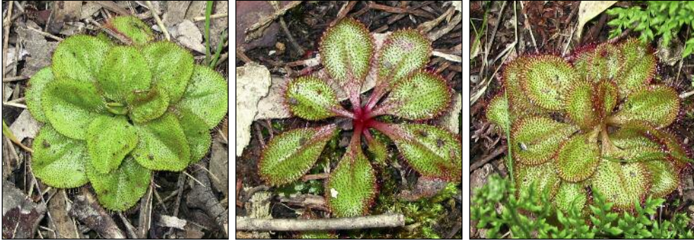
Drosera praefolia from Onkaparinga National Park showing its variation in colour and shape.