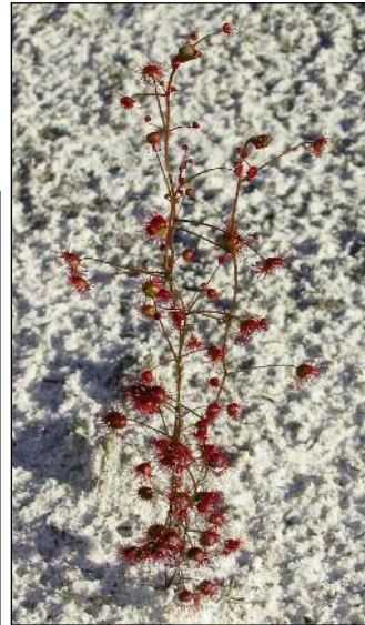
D. macrantha ssp planchonii from Monarto C.P.