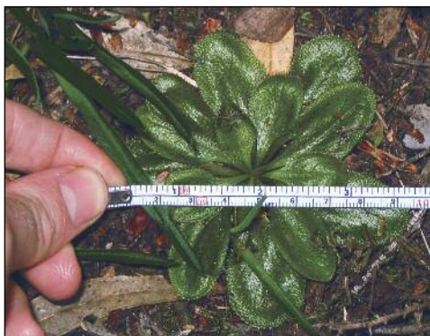
A D. praefolia plant we found in the wild growing in heavy shade, that measured 9cm.

We walked around Anstey Hill for a couple of hours and managed to locate some nice populations of D. whittakerii ssp. whittakerii in flower. These plants were the largest examples of D. whittakerii ssp. whittakerii that we'd seen during the trip. Most of these plants were green and growing amongst short grasses in a clay soil.