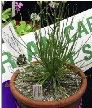
Reserve Champion: Drosophyllum lusitanicum