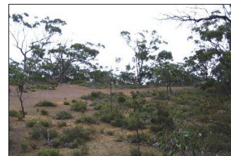
The lateritic habitat at Talisker.

The species of CP that have been recorded in South Australia are: Drosera auriculata , D. binata , D. glanduligera , D. indica , D. macrantha ssp. planchonii , D. peltata var. peltata , D. peltata var. foliosa , D. praefolia , D. pygmaea , D. stricticaulis , D. whittakerii ssp. aberrans , D. whittakerii ssp. whittakerii , Utricularia australis , U. dichotoma , U. beaugleholei , U. gibba , U. lateriflora , U. tenella and U. violacea .