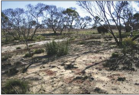
The D. whittakerii ssp. aberrans habitat burnt out by fire near Kiki, South Australia.