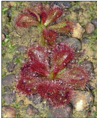
D. whittakerii ssp whittakerii from Talisker N.P.