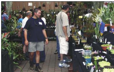
The Drosera display.