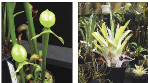
D. californica (left) and C. berteroniana .