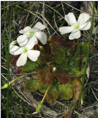
D. whittakerii ssp whittakerii from Anstey Hill C.P.