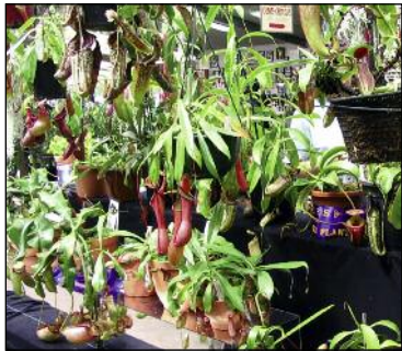
The 2006 Nepenthes display.