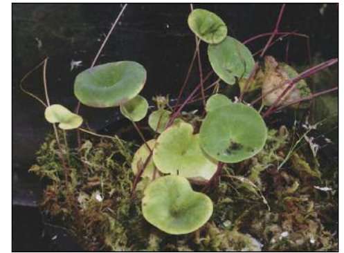
U. nelumbifolia producing stolons.

“The heat and intense sunlight on that treeless