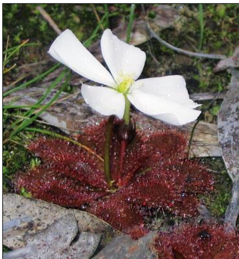
D. whittakerii ssp whittakerii