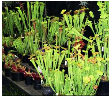
The 2006 Sarracenia display.