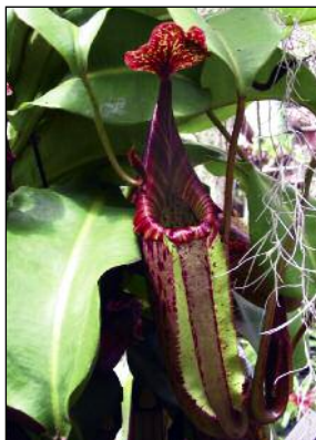
Nepenthes x allardii