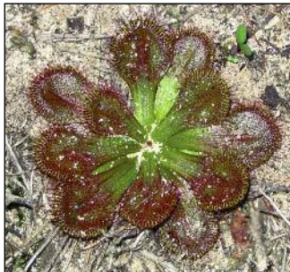
D. whittakerii ssp whittakerii from Monarto C.P.