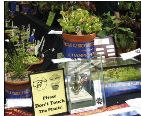
The champion plants of 2005.