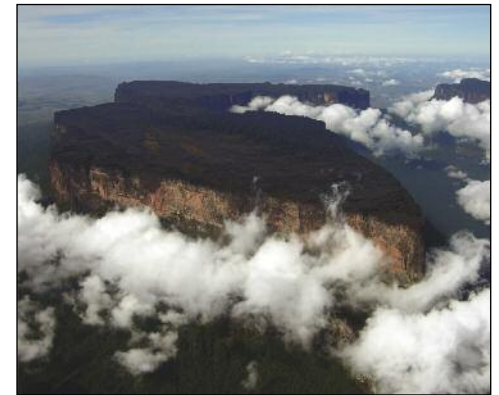
The immense cliffs of Mount Roraima.