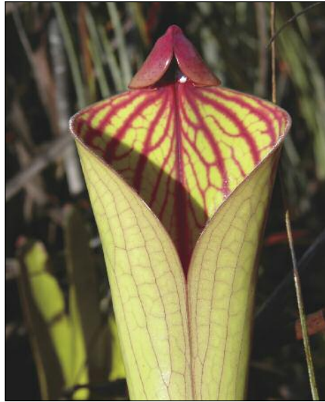
The little known, but very beautiful Heliamphora macdonaldae .

The challenges of visiting this isolated corner of South America were formidable indeed, as they still are today – the watercourse of the Orinoco River and its tributaries were obstructed by rapids, abrupt waterfalls, violent currents and rocky shallows and the land lacked roads of any kind – steep ridges, deep valleys and crevasses made travelling extremely difficult. In such a remote place, all supplies and equipment