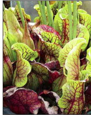
S. purpurea ssp venosa