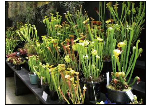
The spectacular Sarracenia display.