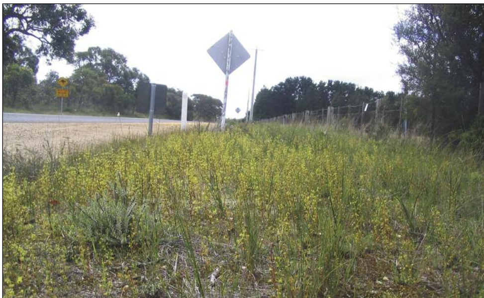
Drosera auriculata growing on the side of a main road near Anglesea.