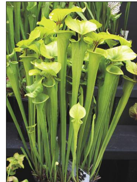
Sarracenia flava var. flava