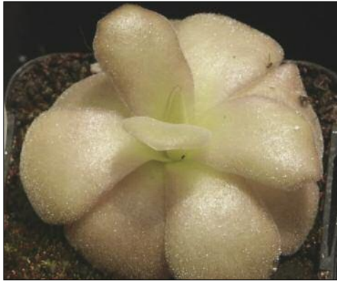
Pinguicula agnata – El Lobo