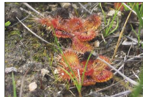
Drosera whittakerii ssp. aberrans

I got back to the car with a few photos of my expedition but thought, "there must be more?" I walked a little way down Forest