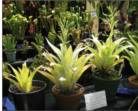
Catopsis berteroniana display.