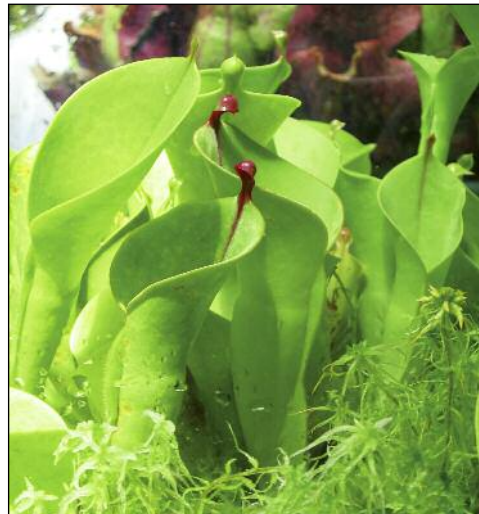
Heliamphora minor x heterodoxa