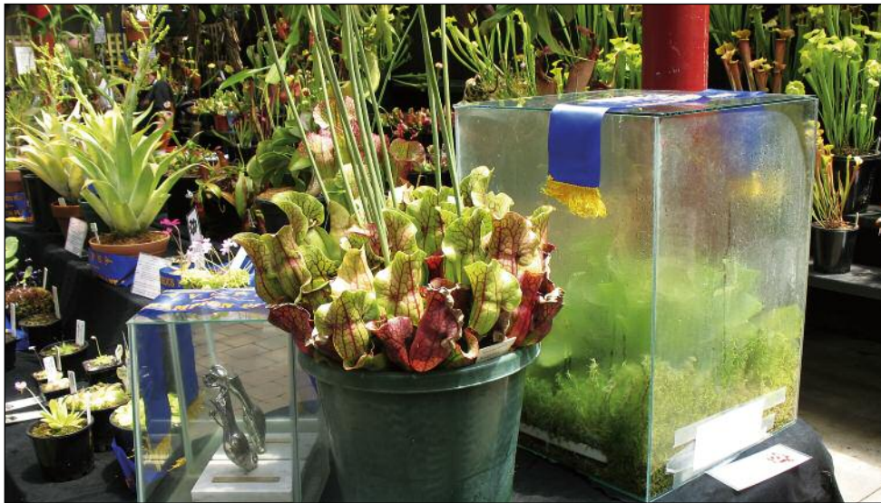
The Grand Champion and Reserve Champion plants at the 2006 VCPS annual show.