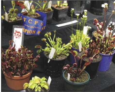
The VFT display.